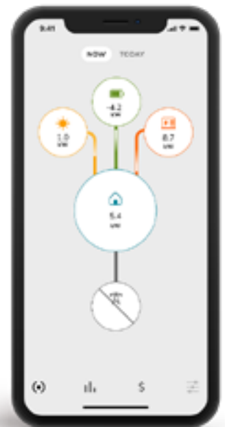
PWRview App Integration